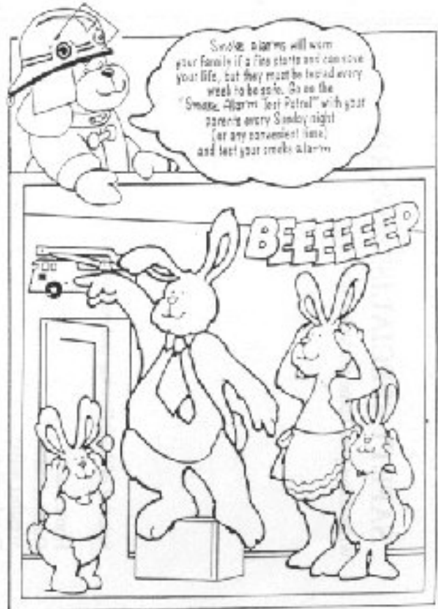
"Make sure your smoke Alarms work."