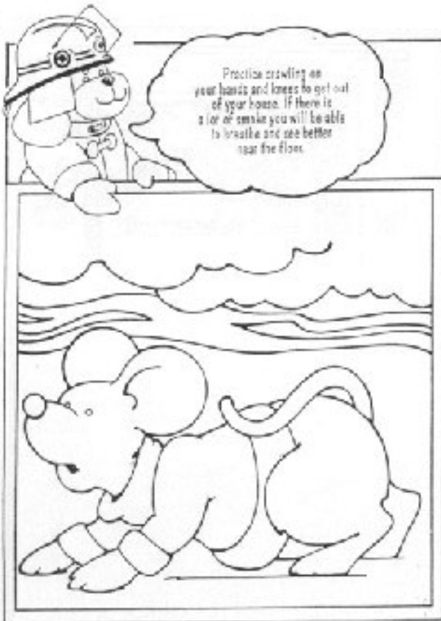
"Practice crawling to safety."

This is the second section and contains firstly five pictures related to fire safety and a fire related crossword puzzle. Then there are pictures of various other emergencies.